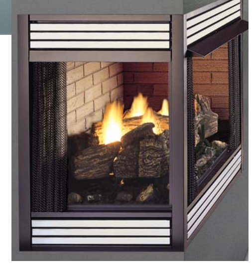
Corner Firebox shown with optional pewter louvers and DST Gas Logs.